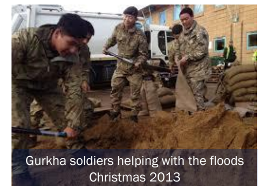
Gurkha soldiers helping with the floods Christmas 2013