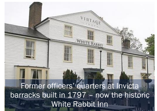
Former officers' quarters at Invicta barracks built in 1797 – now the historic White Rabbit Inn