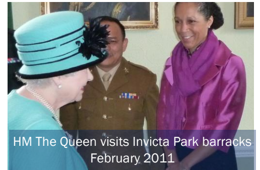
HM The Queen visits Invicta Park barracks February 2011